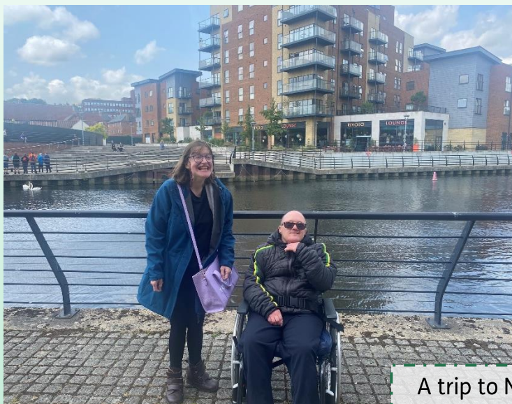
A trip to Norwich

Our lovely residents have had some great days out and activities over the last month – here's a look at just a few!