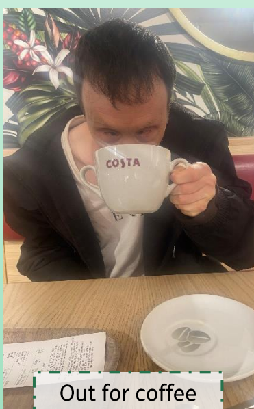
Out for coffee