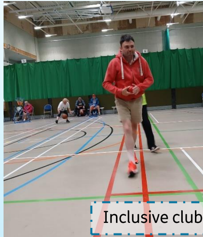
Inclusive club at the UEA