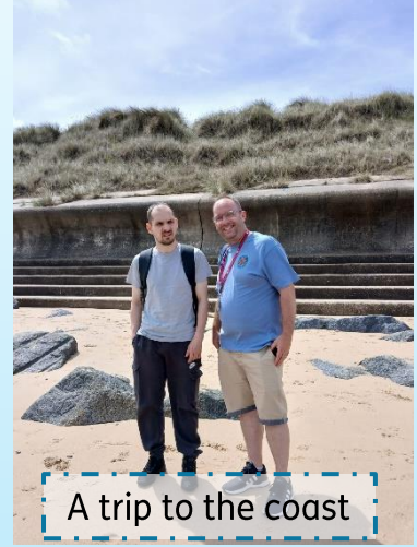
A trip to the coast