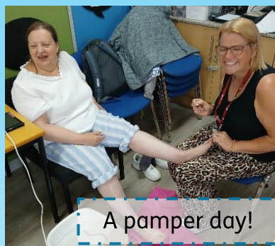
A pamper day!