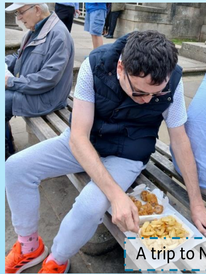
A trip to Norwich