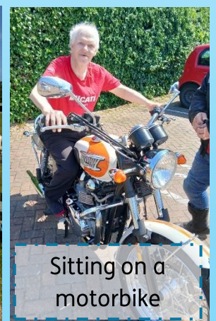
Sitting on a motorbike