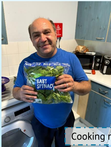
Cooking new foods