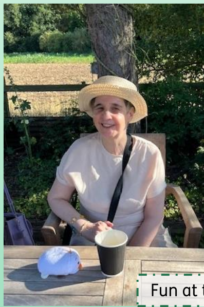
Fun at the Summer BBQ