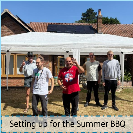
Setting up for the Summer BBQ