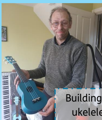
Building a ukelele