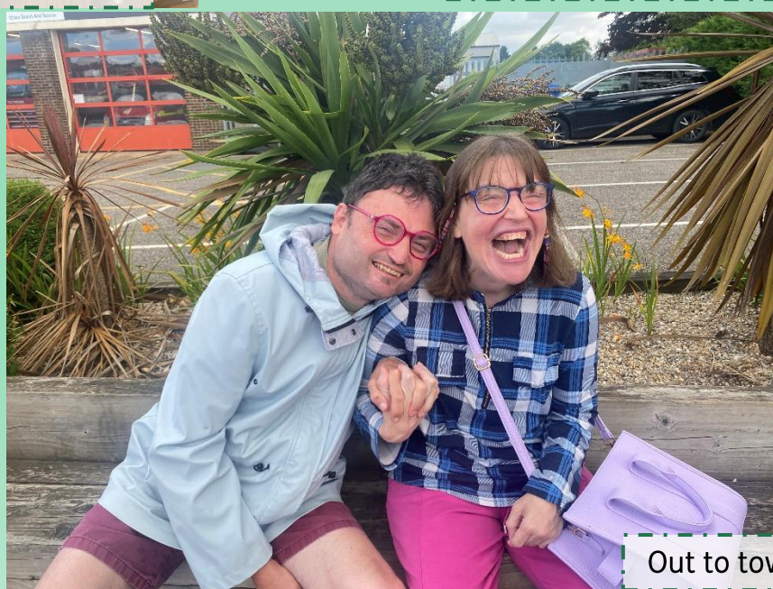
Out to town