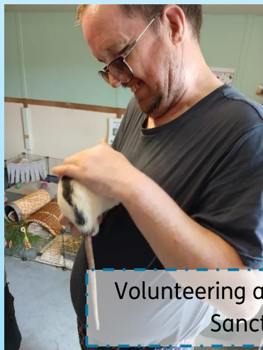
Volunteering at PACT Animal Sanctuary